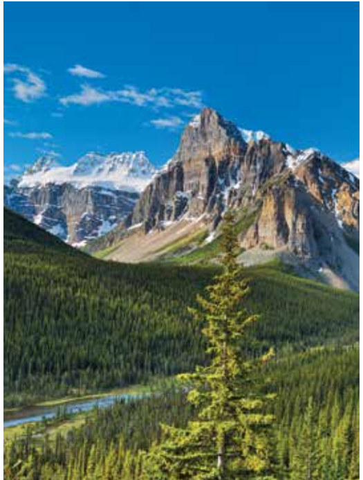
The natural beauty of the Canadian Rockies’ jagged peaks

afternoon is free to explore Banff before we celebrate our outdoor adventures with a farewell dinner at our hotel. B,D