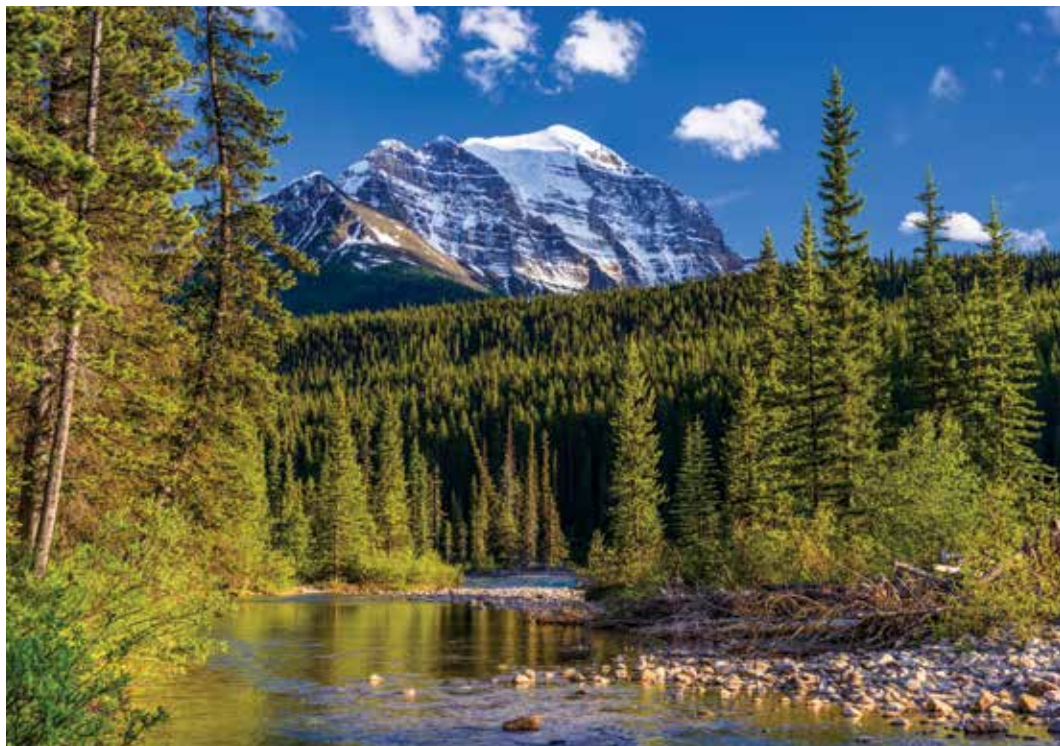
Five national parks sit within the Canadian Rockies.

views and hair-raising turns. After time for lunch on our own we meet up with our motorcoach and continue southwest across the Continental Divide. After arriving late this afternoon in the resort town of Whitefish, Montana, we dine together tonight. B,D