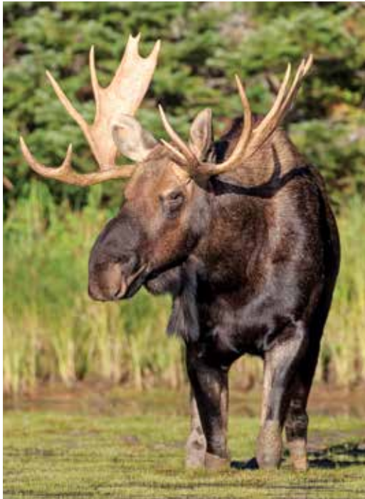
Moose abound in the Rockies.

Day 10: Banff Our last full day in the Canadian Rockies begins with a ride aboard the Banff Gondola to the top of Sulphur Mountain, so named for the hot springs on its lower flank. This 8,000-foot peak overlooking the town of Banff affords stunning mountain views in every direction; indeed, we can see six mountain ranges during this excursion. Then we travel Tunnel Mountain Road to visit two more natural wonders: the Hoodoos, a collection of eroded limestone spires strung along a wooded hillside; and Bow Falls, a wide waterfall just outside Banff. The