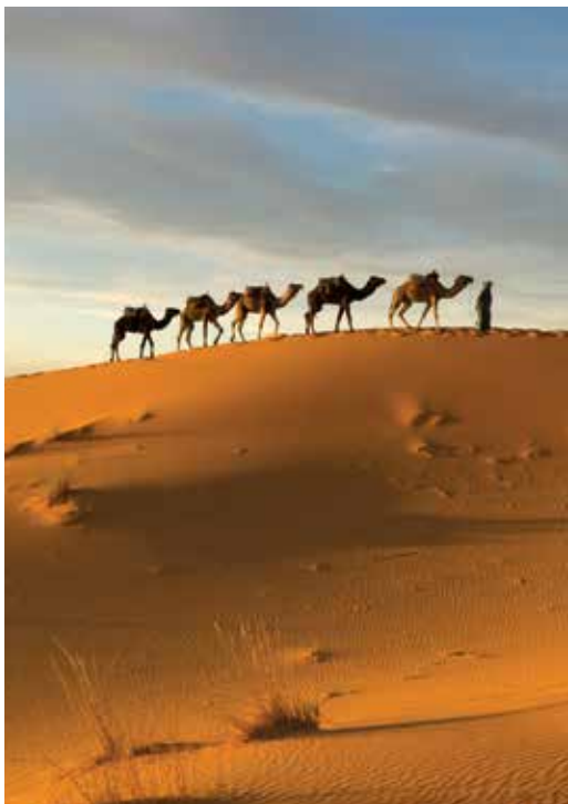
We ride camels in the Sahara on Day 8.

Day 14: Depart for U.S. After breakfast this morning we transfer to the airport for our return flight to the U.S. B